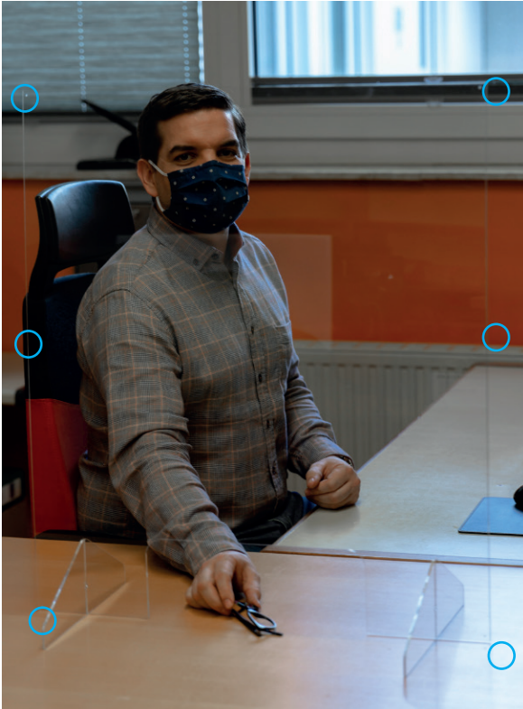
Example: individually in the office