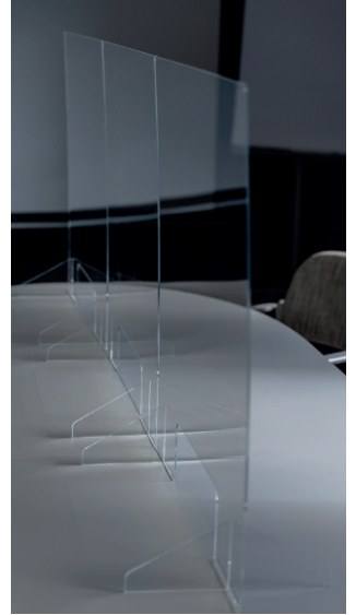
Example: three dividers combined

There are three holes on each side. This allows several divider walls to be connected or fixed with the nylon threads supplied.