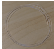
Right: supplied nylon threads