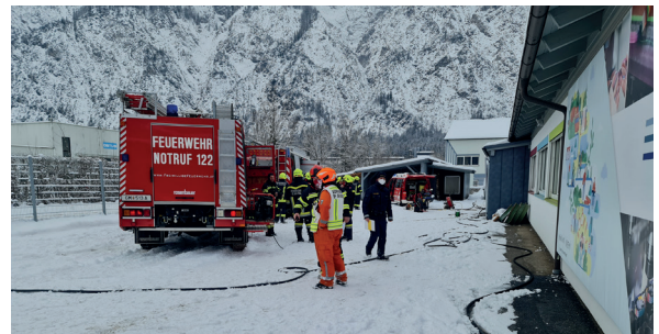
Review of the day of the fire in the production hall.